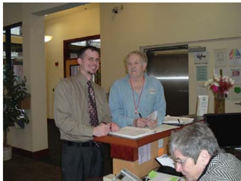
Macdonald Center and Residence photograph