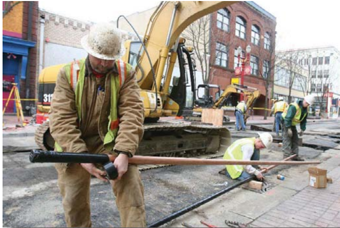
Construction for the I-205/Portland Mall Project is progressing. In February, crews replaced water mains on 5th Ave. between Burnside and Couch. In early March, light rail construction begins on 5th Ave. between Irving and Everett Streets.

Light rail construction in the first work zone provides a detailed example of how the project work will be performed.